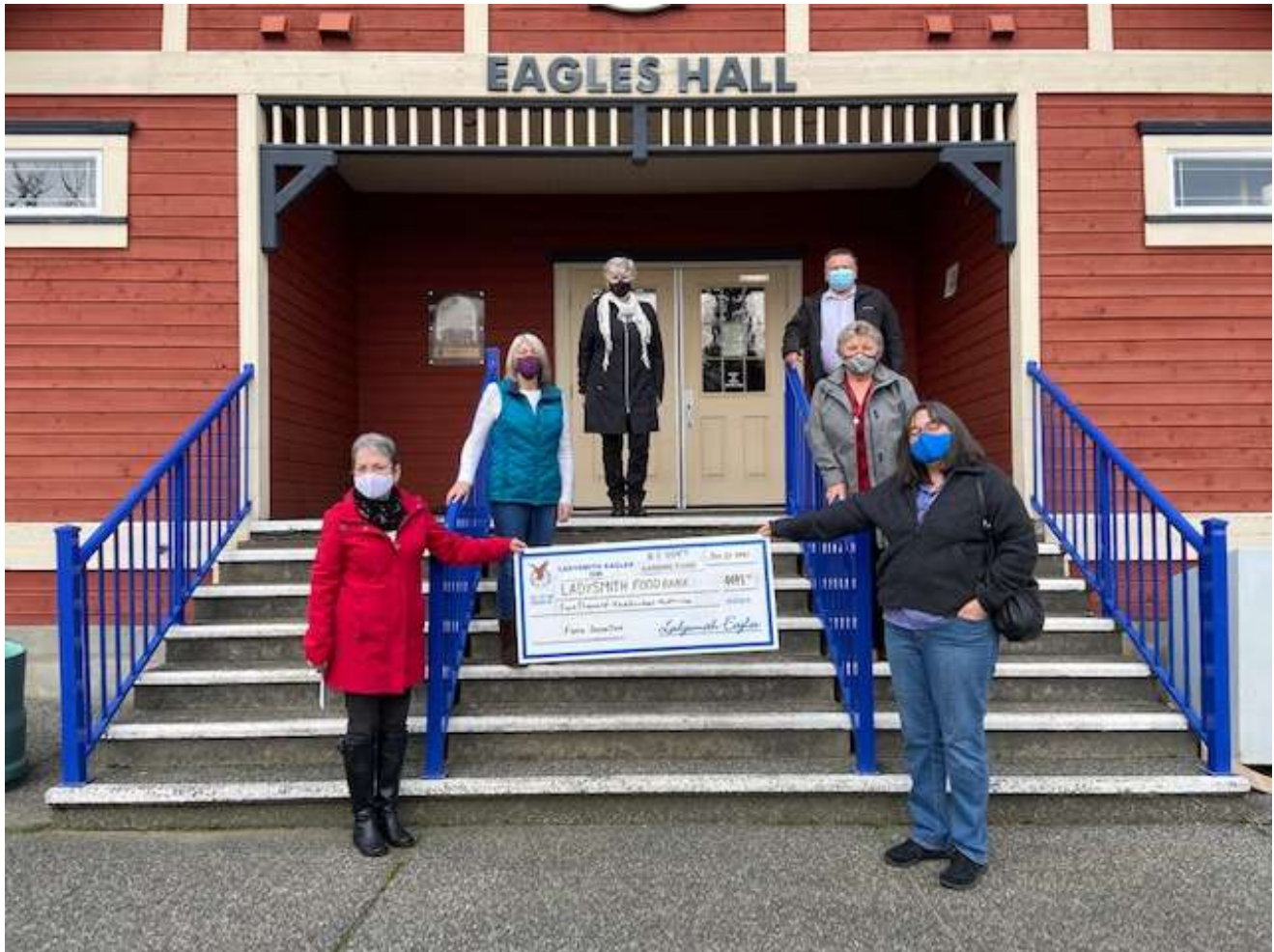
Ladysmith Eagles #2101 donated $4,449.75 to the Ladysmith Food Bank. All Proceeds were raised from their Meat Draws.